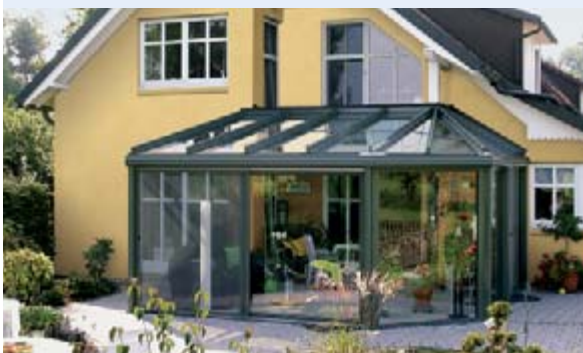
▲ weinor conservatories

No matter what you want to use your patio for, weinor has the right product for you – awning, patio roof, Glasoase® and conservatory