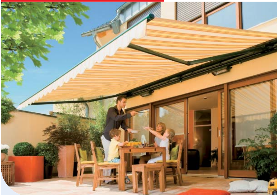
▲ weinor awnings