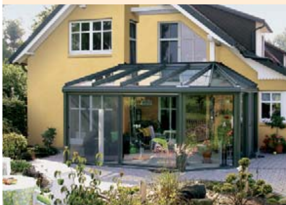
▲ weinor conservatories

No matter what you want to use your patio for, weinor has the right product for you – awning, patio roof, Glasoase® and conservatory